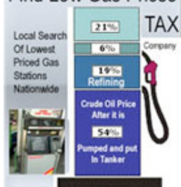
Find Low Gas Prices