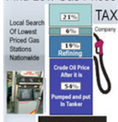
Find Low Gas Prices